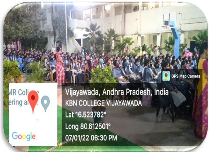
Students at the Programme